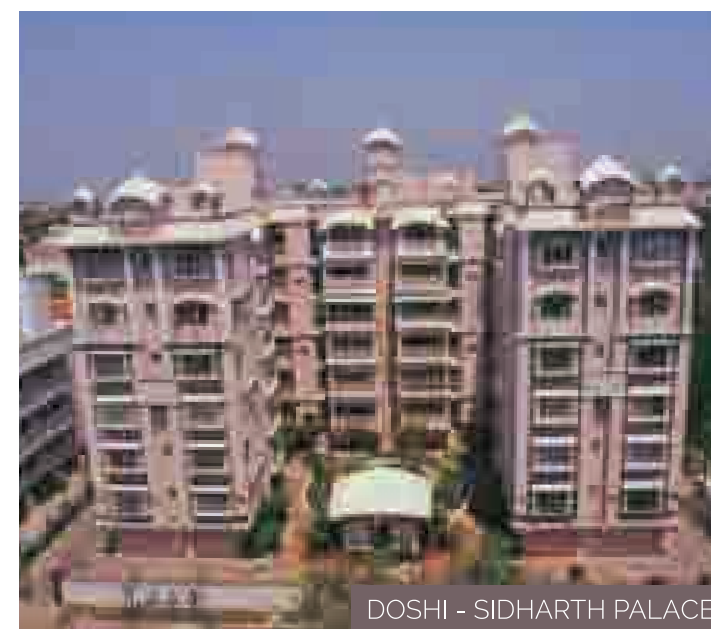
DOSHI - SIDHARTH PALACE