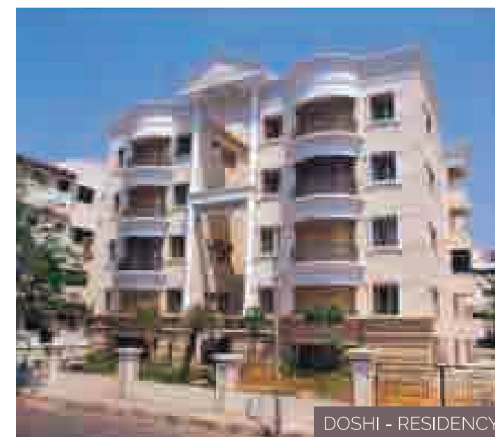
DOSHI - RESIDENCY