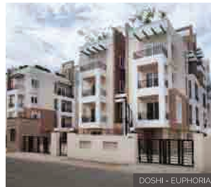
DOSHI - EUPHORIA