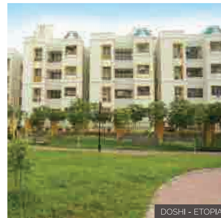
DOSHI - ETIOPIA