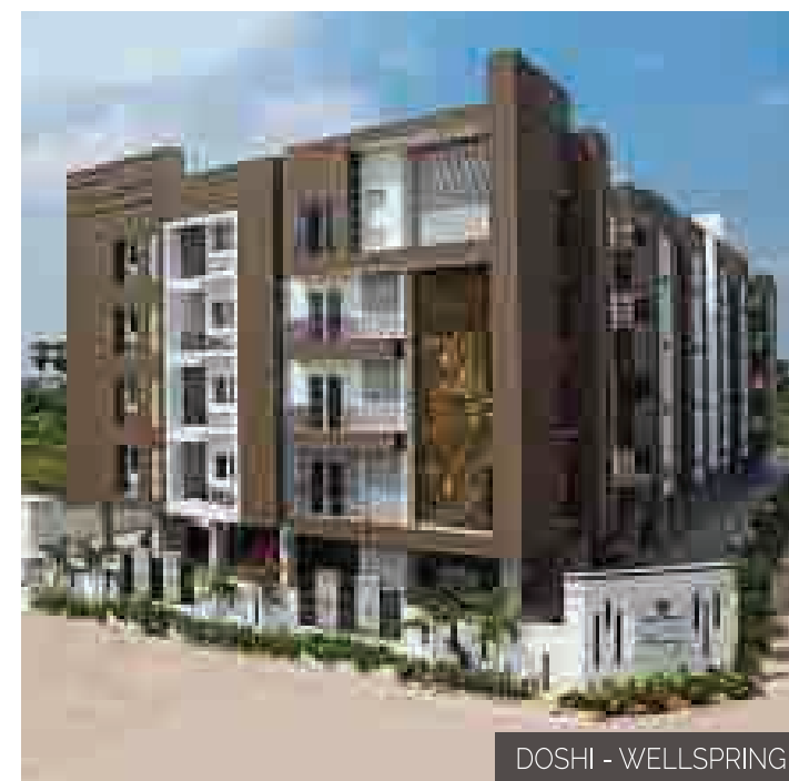
DOSHI - WELLSPRING