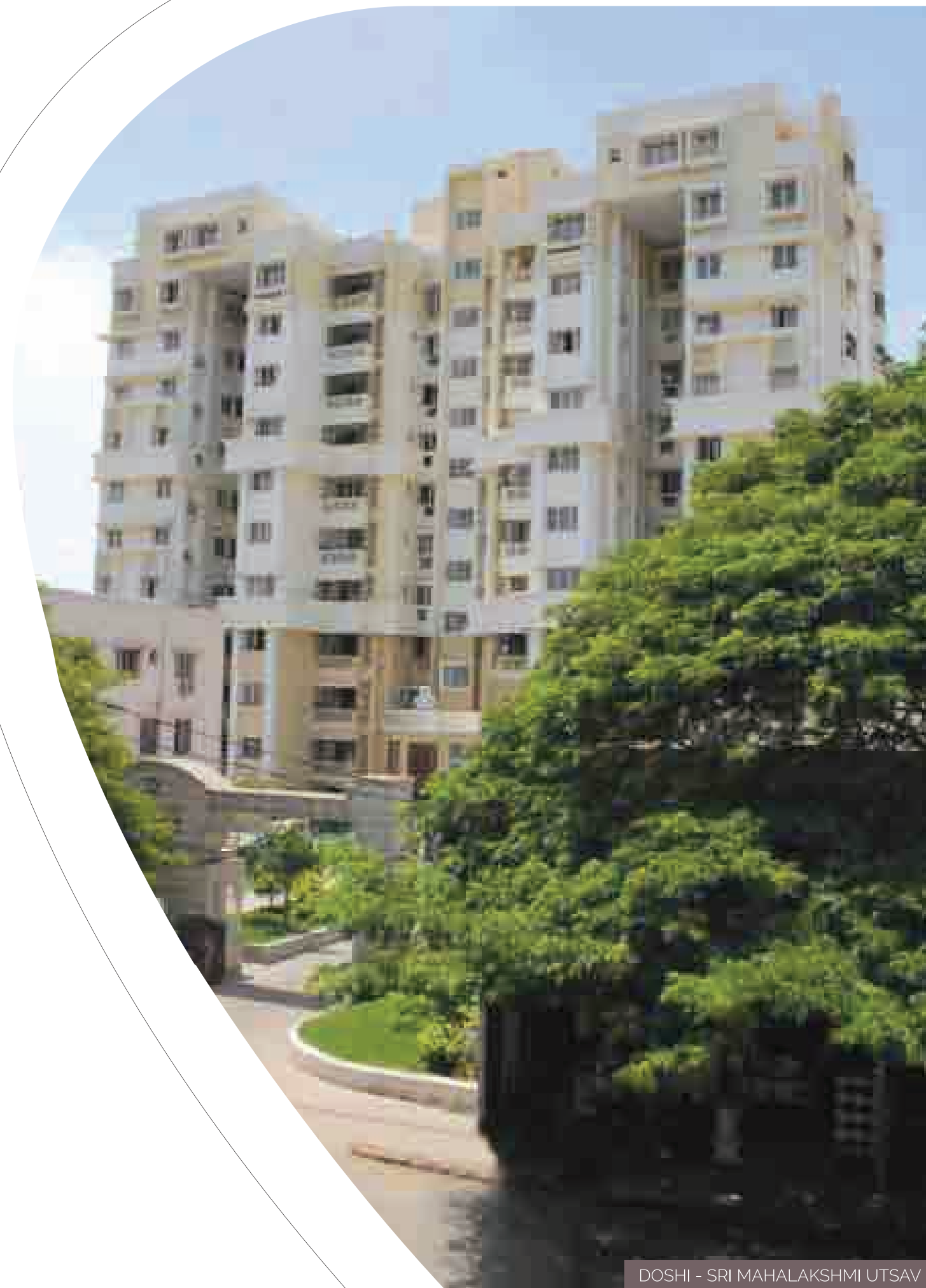
DOSHI - SRI MAHALAKSHMI UTSAV